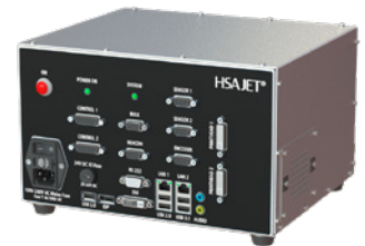
Infinity Controller, 44 & 88 mm (44 mm controller shown in photo)

InkDraw 3 software can be used for different productions and industries and meets the demands within product identification, as well as mailing, postal, and commercial printing.