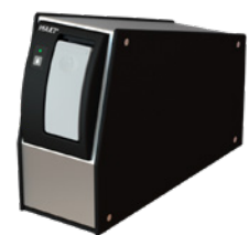
Infinity Bulk Supply Station

Infinity Bulk system is ideal for high speed and high-volume printing ensuring stable and high volume ink supply to the printheads. 775 ml bulk ink cartridges are inserted in the Infinity Bulk system to supply ink to the Infinity printheads, where the 22 mm print cartridges are installed. The bulk ink cartridges can be replaced in less than a minute without specific operator training, allowing seamless continuation of production.