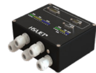
Infinity Interface Box

The Infinity Interface Box with LED control signal is an essential accessory for the HSAJET Infinity Controller. It simplifies installation by allowing direct wire connections via terminal blocks, eliminating the need for soldering. The box supports multiple input/output configurations and includes connection for product sensor. It features LED's for easy visual verification of signal functionality, ensuring efficient and reliable control and connectivity for various applications.