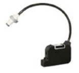
SI1 cartridge for BSF